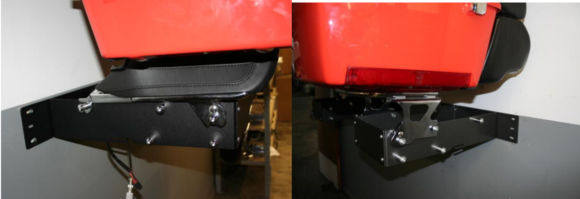
Style A (long)

8 - Determine which style Tour Pak mount you are using. Product comes pre-configured for 2009 and newer FLH/FLT detachable products. 2008 and earlier FLH/FLT are displayed below (style A=long, style B=short). Please consult Assembly Key to configure for different year and model.